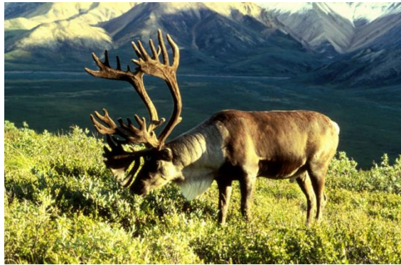
Figure 1. Male Caribou in Alaska

Sámi in Scandinavia, Finland and Russia have controlled herding and hunting by regions where family clans are responsible for land allocation and governance. These regions are traditional family areas. Figure 2 illustrates traditional lands where reindeer herding occurred in northern Europe.