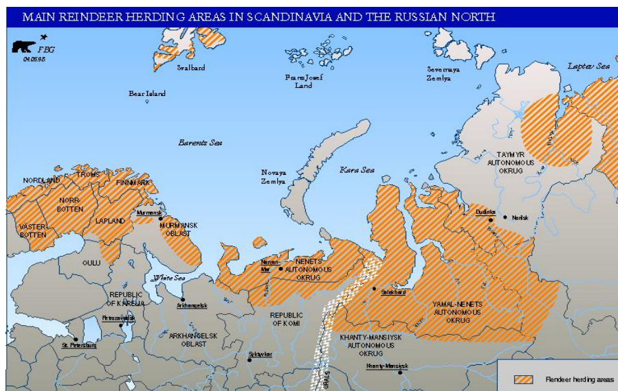
Figure 2. Traditional Reindeer Herding Areas the Barren Euro Arctic Region

Sámi in Scandinavia, Finland and Russia have controlled herding and hunting by regions where family clans are responsible for land allocation and governance. These regions are traditional family areas. Figure 2 illustrates traditional lands where reindeer herding occurred in northern Europe.