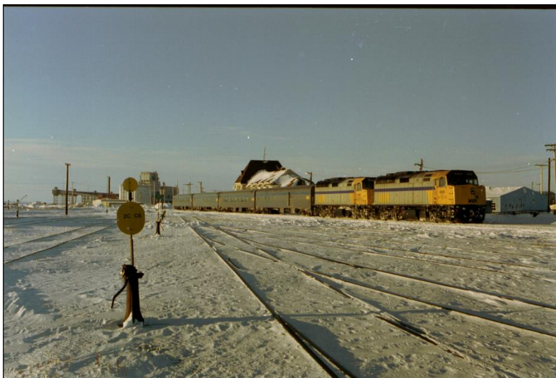
Figure 4. Via Rail Station in Churchill, Manitoba.

Tourism in the North is a growing business as a result of falling transportation costs and marketing of new and exotic Northern experiences. The North has always been appealing as one of the last frontiers and is rich in material resources. The USGS recently estimated that 25 percent of the world's oil reserves lie under the Arctic Ocean.