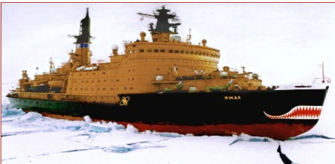
Figure 3: Nuclear icebreaker, Yamal Commander on a National Science Foundation expedition

The first three stages in the development of security in the North can be used to highlight the special features of the various contemporary notions of northern security. All these features deal first with either the discourse on traditional security or that of comprehensive security; second, the environment; third, many of the peoples and societies, either directly or through environmental degradation; and fourth, while one of them, the technology models of geopolitics, is related to militarization (see Figure 3), most of the others represent alternative discourses on security. Finally, they manifest that interesting feature of security in the North exhibited in the early-21 st century whereby there have emerged several types of northern securities (see Heininen 2010a).