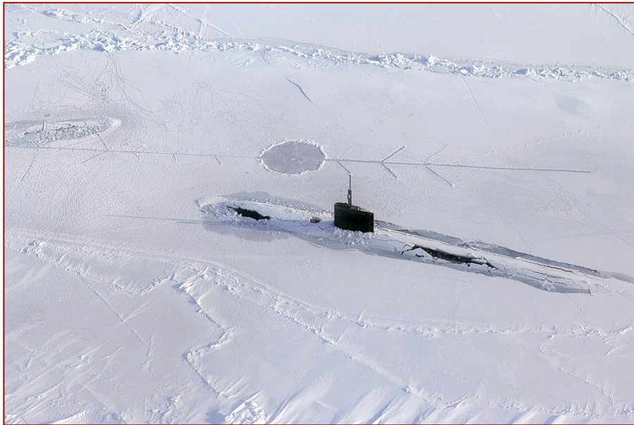
Figure 1: Nuclear Submarine in Arctic Waters (

Source: http://en.wikipedia.org/wiki/File:USS_Annapolis_ICEX.jpg Public Domain. U.S. Department of Defense photo by Petty Officer 1 st Class Tiffini M. Jones, U.S. Navy.