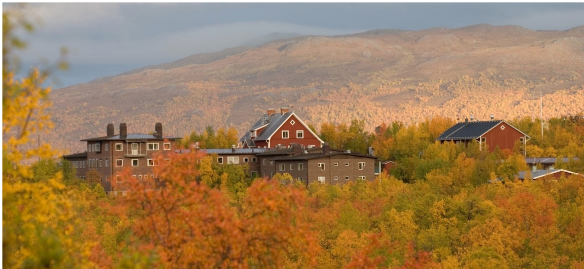
Abisko Scientific Research Station, Abisko, Sweden

Today the Arctic is on the frontline of many important global issues. Climate change is occurring here faster than the rest of the globe. Through teleconnections between the Arctic climate and the south, changes here have important global implications. Climate and environmental change, contaminants and indigenous peoples are all issues we are passionate about in this rapidly changing Arctic.