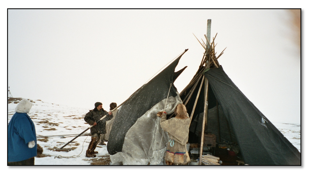
Figure 2. Setting Up a Tent after Migration in the Tundra, Nenets Autonomous Okrug, May 2006.

As settlers from farming and fishing cultures to the south populated northern Eurasia, mixed economies evolved with new activities introduced by settlers, who also adopted many indigenous practices. Settlers had to adapt their livelihoods in northern areas, with only a few groups able to sustain their previous livelihoods without substantial changes. For example, Norwegians adapted their fishing, sheep herding and dairy farming practices to climates north of the Arctic Circle, as well as to Iceland and Greenland. Mixed populations of Finnish settlers and Forest Sámi in Finnish Lapland developed a mixed economy of hunting, fishing and dairy farming alongside reindeer herding. Later, Finnish settlers to Norway, called Kvens, adopted sea fishing combined with small-scale farming. Some Sámi became farmers or combined small-scale agriculture with reindeer herding or hunting and fishing. Even nomadic Sámi had some sheep, as did some Nenets, the indigenous peoples from Russia as pictured in Figure 2.