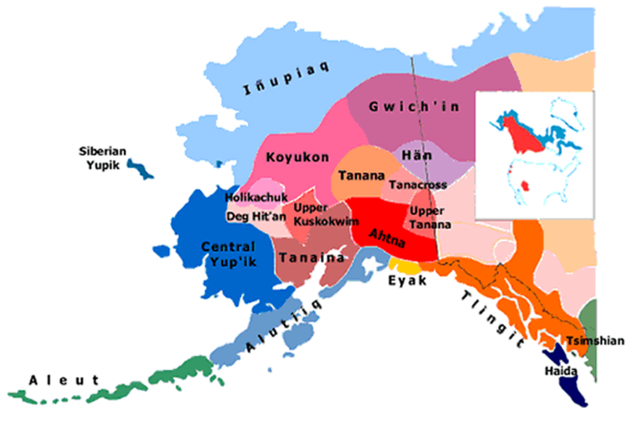
Figure 3: Alaska Native Languages Map

In North America, a population is generally regarded as indigenous if ancestry can be traced to a period prior to contact with European colonizers and settlers. Alaska, as part of the United States, makes an official census every ten years and identifies Native Americans, but is inconsistent about tribal designations. In Alaska, the work tallying native populations and native language speakers has been done largely by the Alaska Native Languages Center at the University of Alaska, Fairbanks, resulting in very good figures with an emphasis on language affinities, rather than official definitions (see Figure 3).