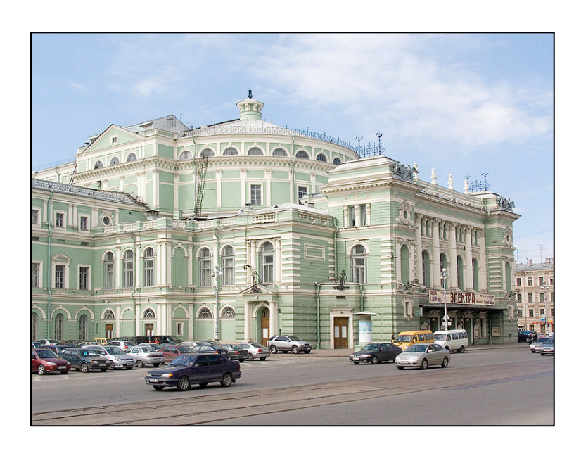
Figure 5: Mariinsky Theatre in Saint Petersberg.