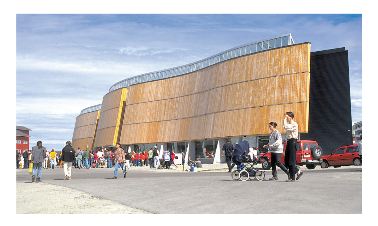
Figure 6: Katuak Cultural Centre in Nuuk, Greenland.