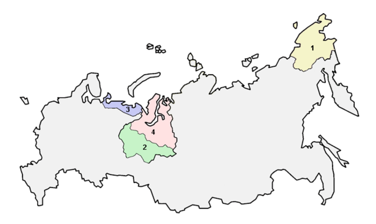
Figure 2 Autonomous Okrugs of Russia as of March 1, 2008. 1. Chukotka, 2. Khanty-Mansi, 3. Nenets, 4. Yamalo-Nenets

"...federal governance in which an autonomous territorial unit (or units) exists within a recognized constituent unit of the federation. Such territorial units have limited territorial autonomy within their "host" region, but this autonomy is usually greater than that of a municipal or local government." (Wilson, 2005: 97)