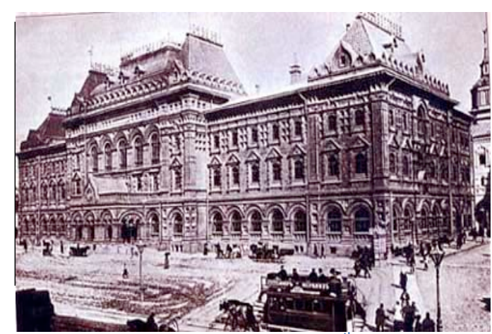
Figure 1 Moscow City Hall at the turn of the 20<sup>th</sup> Century

level of government enhanced powers or jurisdiction. Sometimes economic and social changes place more responsibilities on the governments that have jurisdiction over those areas. For example the Canadian federation was quite centralized when it was first conceived in the 1860s. However, over the course of the last century, the rise of the Welfare State and an increase in the importance of natural resource and energy production and use (both areas of provincial jurisdiction) have enhanced the responsibilities and, in some cases, the power of the provincial