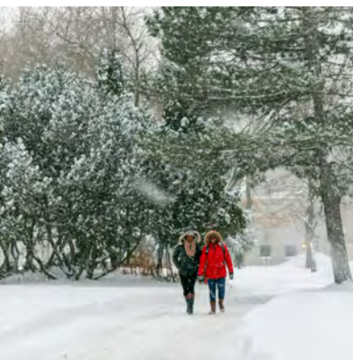
Pub Photo / ULaval