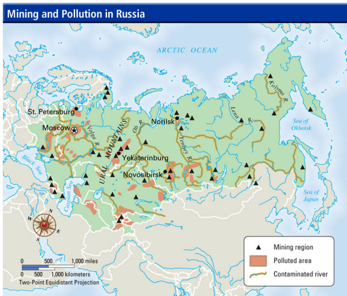
Figure 2.3 Mining regions and polluted areas in Russia.

Some of the Arctic's biggest sources of pollution occur on the Kola Peninsula in Russia. Metals extracted there, primarily nickel and copper, occur in sulphur compounds and when smelted enormous quantities of sulphur dioxide are released into the environment damaging or destroying nearby vegetation. The area exhibiting vegetation damage has grown steadily since the 1970s and is now 4,000 – 5,000 km 2 . In these areas there is massive forest dieback and the lichen flora is greatly depleted. Figure 2.3 shows the relationship between mining activities and polluted areas in Russia.