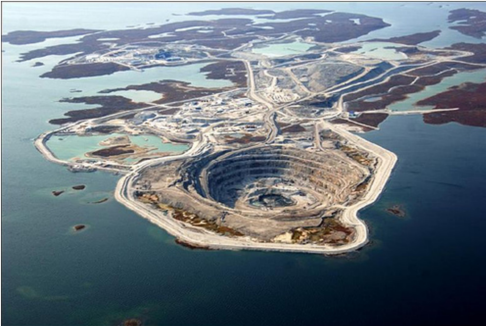
Figure 2.2. The Diavik Diamond mine in northern Canada is an example of an open pit mine.

Solution mining also sometimes referred to as in-situ leach or in-situ recovery is a mining process used to recover minerals through boreholes (the generalized term for any narrow shaft bored in the ground either vertically or horizontally) drilled into a deposit in situ. In-situ is a term used to mean “in place” or “in site”. Solution mining leaches or recovers minerals from the deposit without first moving the ore to a processing facility. Solution is pumped into the ore body via a borehole and circulates through porous rock dissolving the ore, which is then extracted through a second borehole. The solution used depends on the type of ore and mineral, but is often acidic. Copper, potash and uranium are examples of minerals often extracted by solution mining.